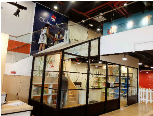
An overview of the BookRoom and of Mont' Kiara centre.

C hiltern House Mont' Kiara opened its doors to a warm welcome at Gateway Kiaramas, housing comfortably alongside Julia Gabriel Centre, and Chengzhu Mandarin Centre. We greeted our first batch of students in Nursery One and Nursery Two, who eagerly began their first day of school on January 3rd.