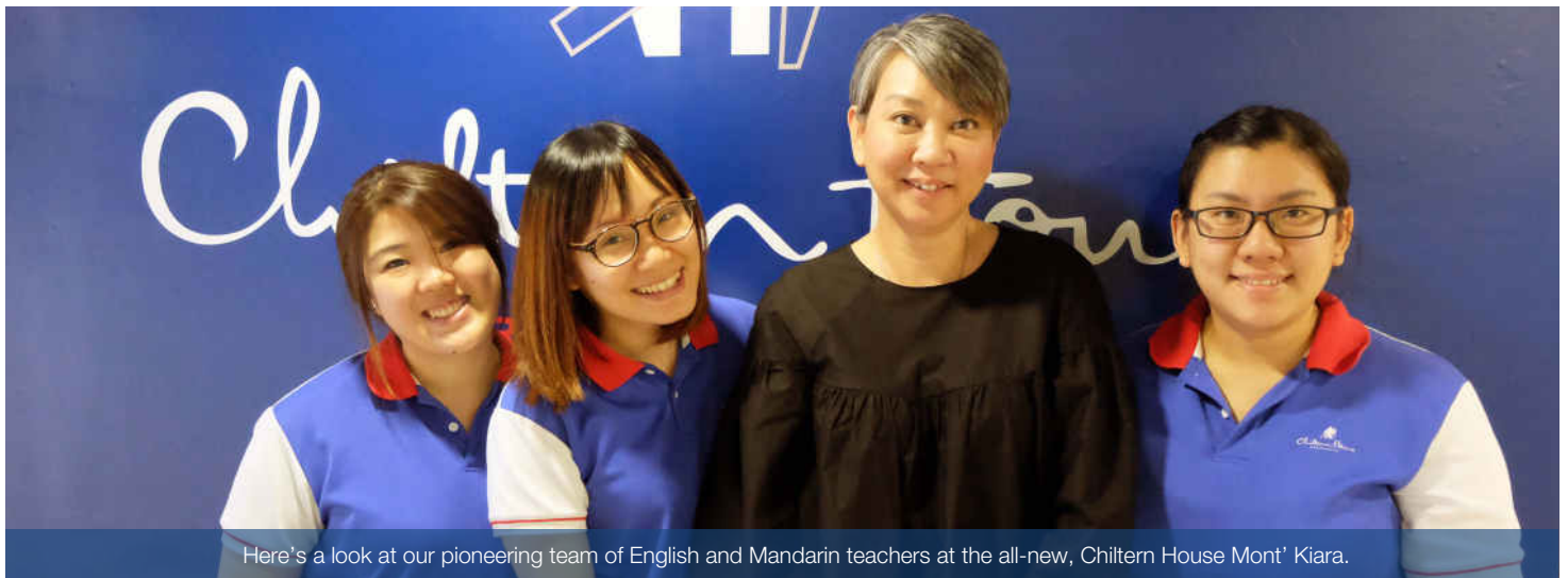
Here's a look at our pioneering team of English and Mandarin teachers at the all-new, Chiltern House Mont' Kiara.

C hiltern House Mont' Kiara opened its doors to a warm welcome at Gateway Kiaramas, housing comfortably alongside Julia Gabriel Centre, and Chengzhu Mandarin Centre. We greeted our first batch of students in Nursery One and Nursery Two, who eagerly began their first day of school on January 3rd.